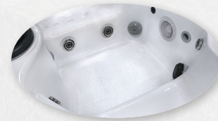
Spacious 2 Person Foot Well