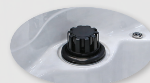
50 Sq. Ft. Bio-Clean™ Filter