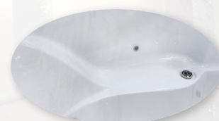
Step Rest for Easy Entry