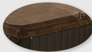
Hydro-Armor™ Spa Cover