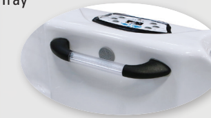
Waterfall Handrail LED Lighting Package