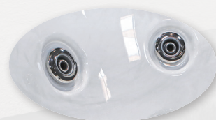
Stainless Steel Halo Jets