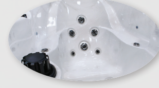
Reclined Seating for Optimal Comfort